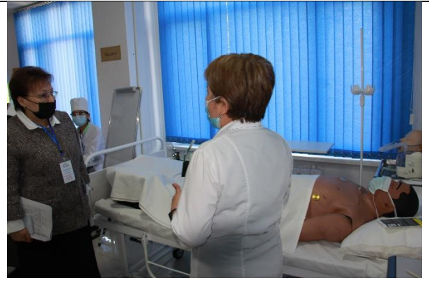
Photo 4. Review by members of EEC of the Center for Simulation Technologies

The EEC members examined the microbiology laboratory, which meets all the requirements for conducting practical exercises in the specialty "Laboratory diagnostics".